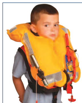
Aqua Junior 100, fully inflated.