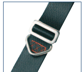
*ISO 12401 Harness available.