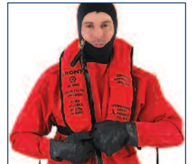
*Red Nylon Cover