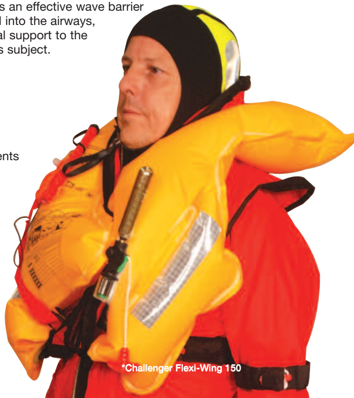
*Challenger Flexi-Wing 150